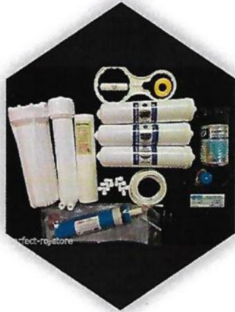
Domestic RO Accessories