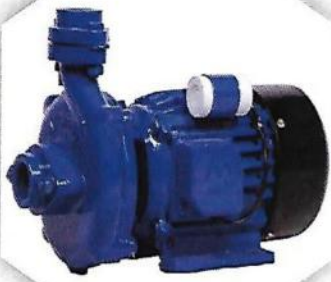
Horizontal Centrifugal Pump