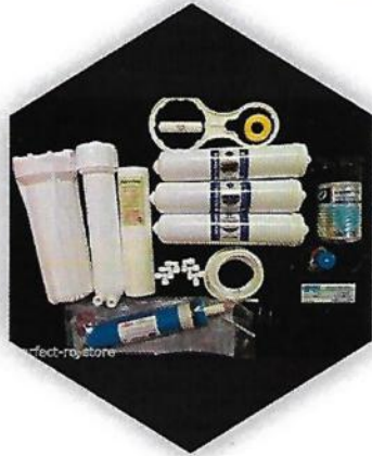
Domestic RO Accessories