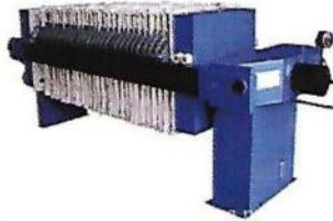
Filter Press Machine