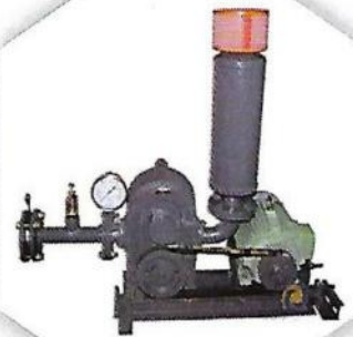
Twin Lobe Air Blower