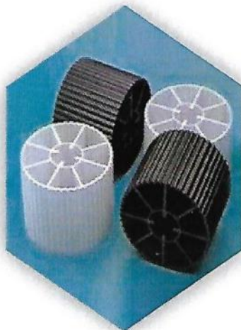
Plastic MbbR Media