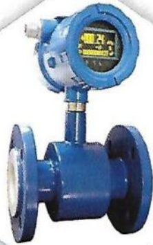
Electromagnetic Flow Meter